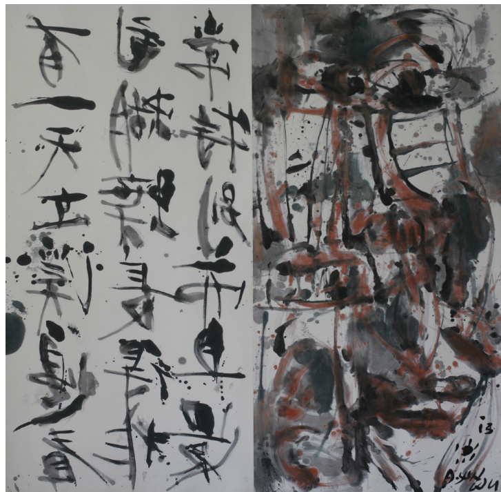
Ancient instructions given to youths, 2013, Chinese ink on paper rice 141 x 141 cm.

In 1996, the gesture of A-Sun started to be more simplified and refined inspired by the oriental philosophy. In order to achieve this, he mainly uses red, black and white, respectively symbols of life, power and peace (Buddhists and Taoists ideas)