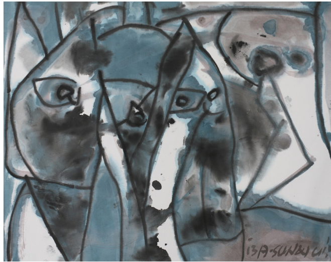
Faces of three women, 2013, Chinese ink on rice paper 65 x 52 cm.

With the researches he conducted and the primitive energy that stems from it, A-Sun Wu transcribes in his works, his vision of a world in which Mankind is confronted with his natural environment.