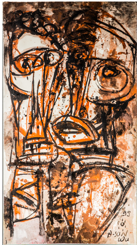
Women from the south Pacific, 1999, Chinese ink on rice paper, 142 x 78 cm.