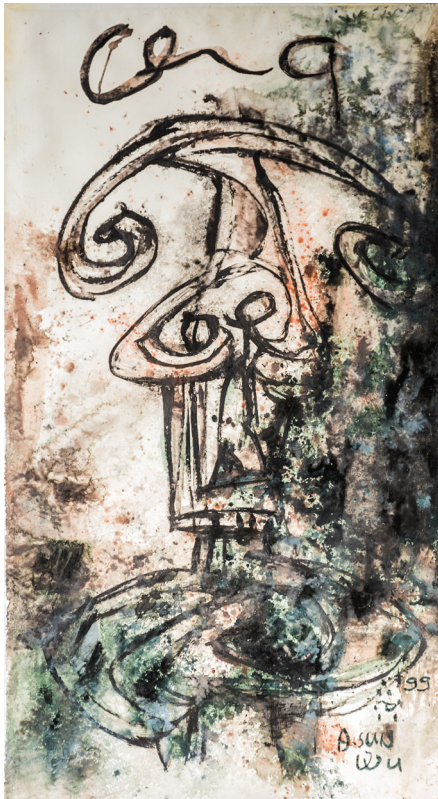
Chief tribe 1999, Chinese ink on paper, 142,5 x 78,5 cm.

The juxtaposition of primitivism and Occidental modernity experienced during his travels is perfectly summarized in his recent works displayed by baudoin lebon. The ultimate goal of his approach is finding again this sacred bond with the essential elements of our world.