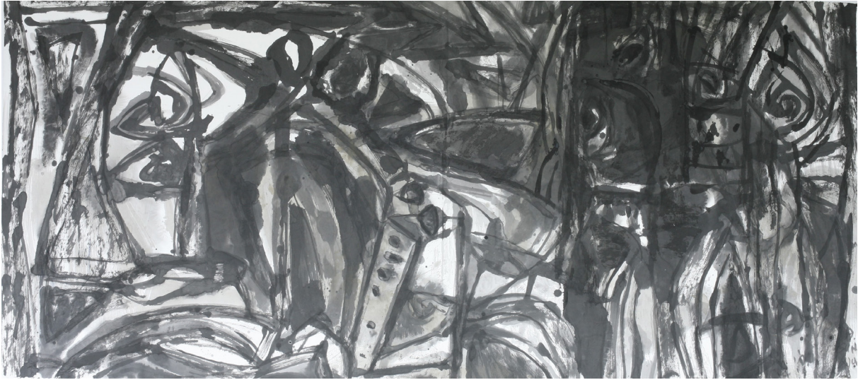
Getting out of the light, 2014, Chinese ink on rice paper, 98 x 219 cm.

The juxtaposition of primitivism and Occidental modernity experienced during his travels is perfectly summarized in his recent works displayed by baudoin lebon. The ultimate goal of his approach is finding again this sacred bond with the essential elements of our world.