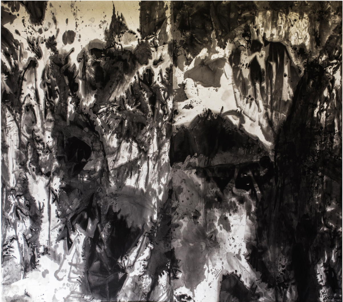
Mounts Huang sang by the thousand mountains and tons of water, 2014, diptych in Chinese ink on rice paper, 200 x 223 cm.

This powerful style is translated by a violent gesture which one can find in A-Sun Wu Mount Huang's landscapes or in the portraits of the tribes he met during his travels.