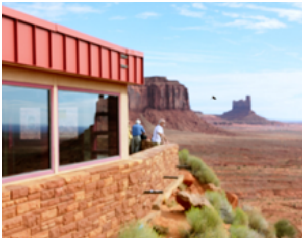
From bottom to top: Monument valley, 2022 and Flood, 2022 series Nothing new in the west, pigment print, 45 x 36 cm © Roei Greenberg courtesy baudoin lebon