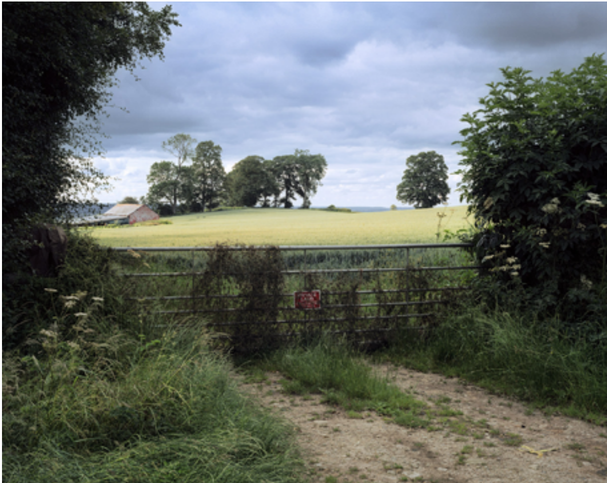
Hinterland , 2019, series English Encounters , pigment print, 120 x150 cm

In 2022, he won the Camera Clara Award with the series English Encounters .