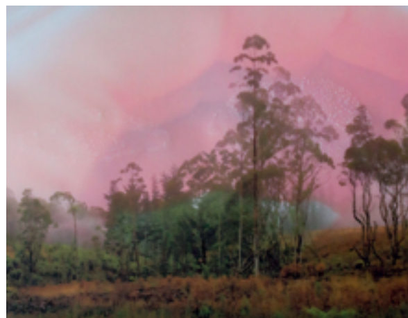
Fire)(scapes , 2021, pigment prints on vegetable paper and mat paper, drypoint embossing, 42 x 60 cm © Juliette-Andrea Élie courtesy baudoin lebon

Through sociological, meteorological and philosophical approach, she creates photographic objects by superimposing archival images reworked with embossing and pyrography on photographs of human skin. Intensified by chromatic manipulations, these landscapes evoke the color of fire skies, reminding us of our crucial role in the preservation of nature and the need to engage in a dialogue with it.