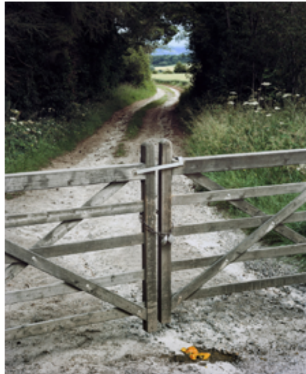
Walk to Paradise Garden, 2019, series English Encounters, pigment print, 45 x 36 cm © Roei Greenberg courtesy baudoin lebon