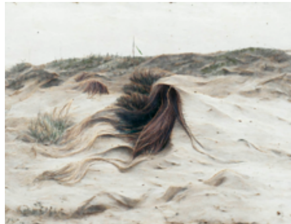
Tu dormais sur la plage avec un livre / You were sleeping on the beach with a book Plage livre , 2022, series I've forgotten this before , pigment print, 29,7 x 42 cm © Mathieu Bernard-Reymond courtesy baudoin lebon

The series was made using artificial intelligence tools. Some images were published in special edition dedicated to IA of the swiss magazine T - Le Temps , October 22, 2022.