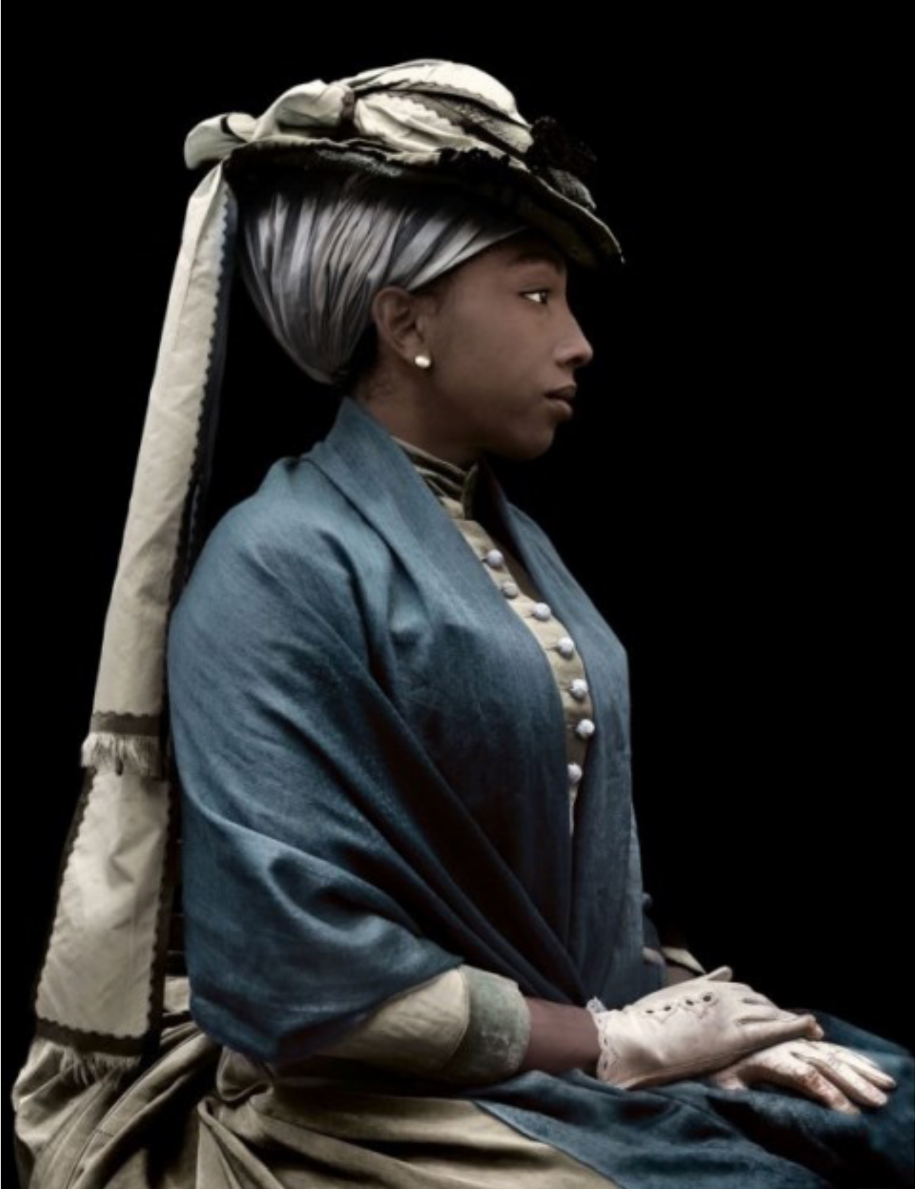
Tignon , 2015 archival pigment on German etching paper 104 x 80 cm 5/8 edition