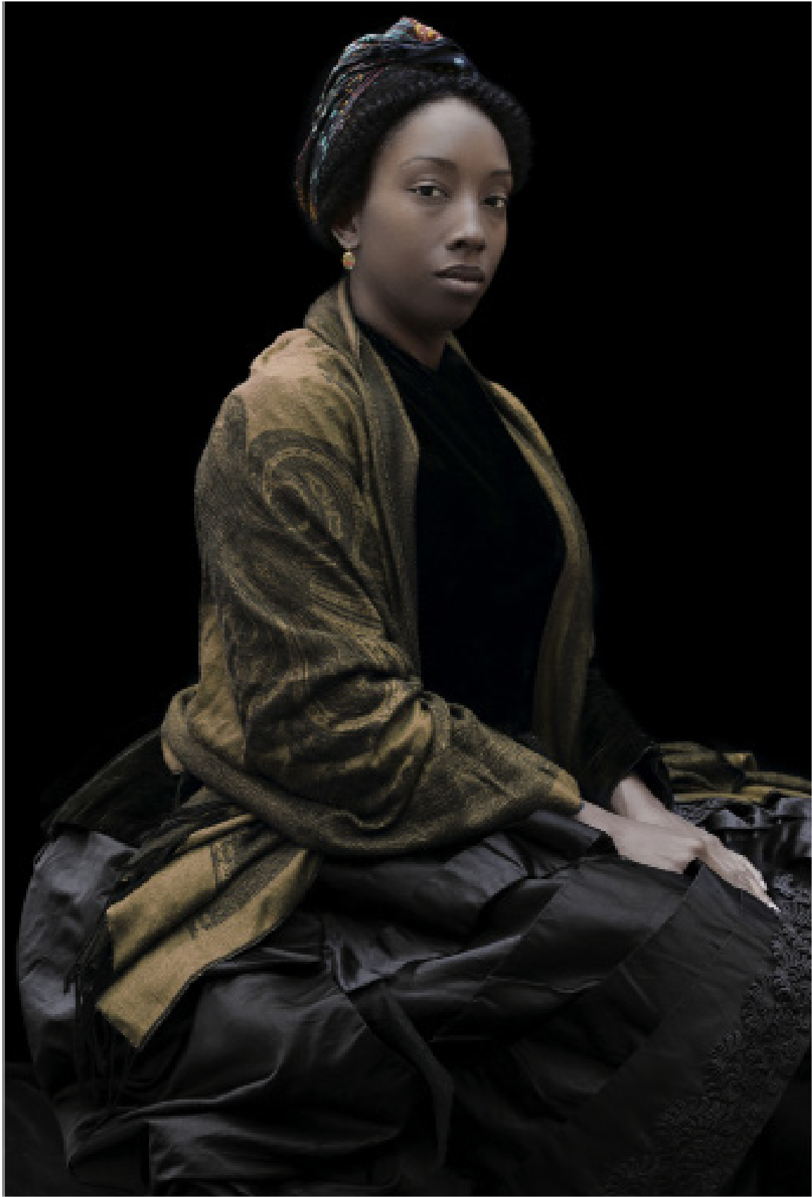
Iqhiya , 2015 archival pigment on German etching paper 104 x 65 cm 3/8 edition