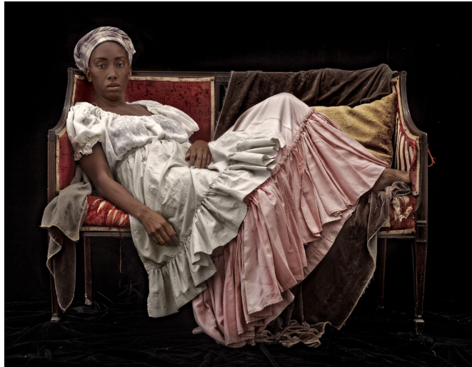
above Saffronia , 2017 archival pigment print on German etching paper 100 x 130 cm 2/8 edition

Ayana's work is obviously a matter of self-portraits. The creative process is consistently the same: alone in front of the camera, she triggers herself the self-timer, thus becoming both the artist and the subject. Ayana's body, whether clothed or nude, is a tool, an excuse for figuration, for representation. The subject is not the body but the testimony, the presence settled in DNA and in history revealing the need to a personal and deep justice.