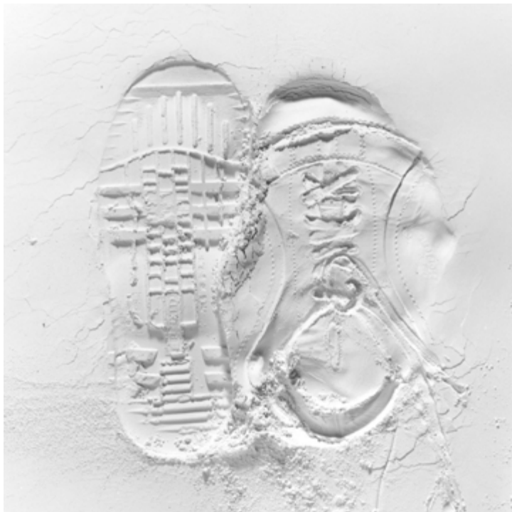
Patrick Bailly-Maître-Grand Apollo XI series , 2011 Silver print 50 x 50 cm Edition 2/5 © Patrick Bailly-Maître-Grand courtesy baudoin lebon