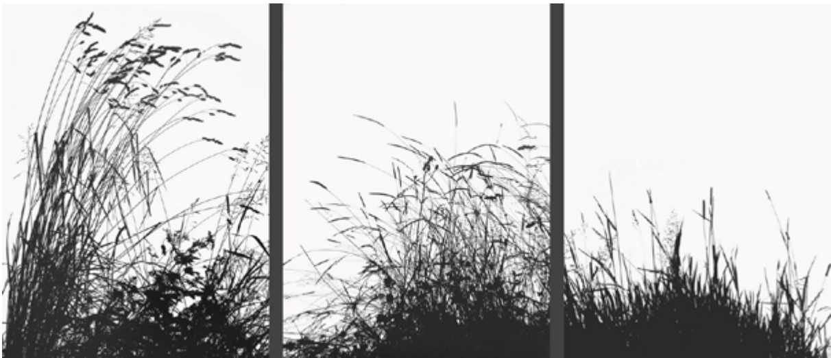
Patrick Bailly-Maître-Grand, Les herbes , 2002, triptych, silver print, edition 3/5, 100 x 75 cm

International museums, like the MoMA, the Centre Pompidou, the National Contemporary Art Fund, the Museum Victoria in Melbourne, the Sainsbury Centre in Norwich (GB), the Museum of Modern and Contemporary Art of Strasbourg, the Museet for Fotokunst Odense, etc., exhibited and included in their collections Patrick Bailly-Maître-Grand's works.