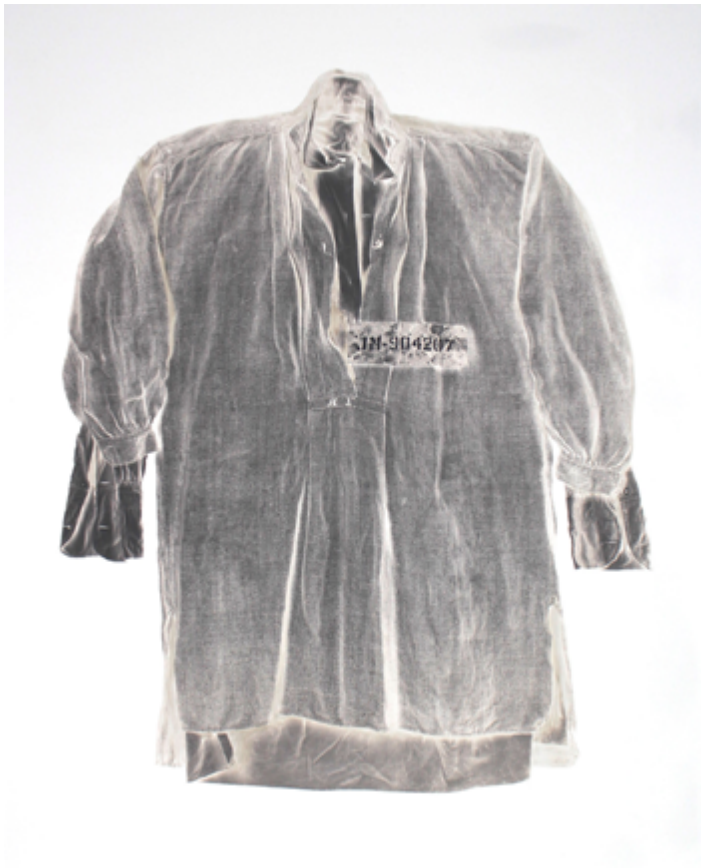
Patrick Bailly-Maître-Grand Les Guenilles series, 2015 Direct Monotype Silver print 100 x 80 cm © Patrick Bailly-Maître-Grand courtesy baudoin lebon