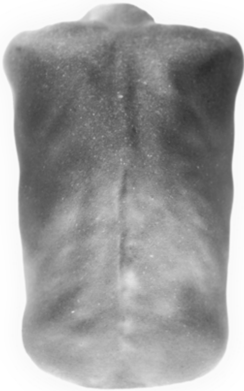
Patrick Bailly-Maître-Grand Phidias series, 1999 Direct Monotype Silver print 58 x 47 cm