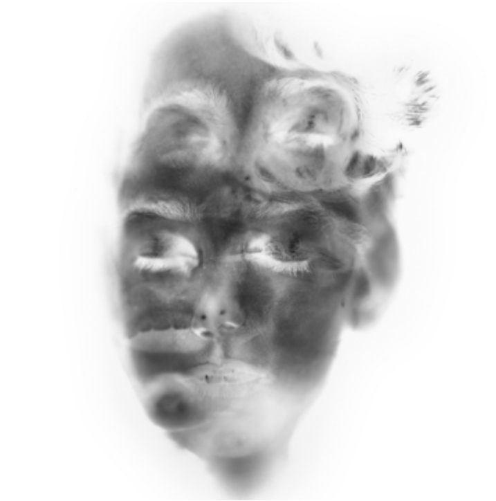
Patrick Bailly-Maître-Grand Veronique , 2014 Silver print Edition 1/3 40 x 40 cm © Patrick Bailly-Maître-Grand courtesy baudoin lebon